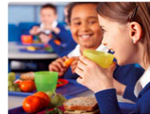
Free school meals Eligibility and how to apply for free school meals.