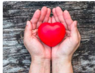
Health and wellbeing Ways to stay healthy and protect your health.