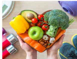
Eating well How you can eat well and why it's important.