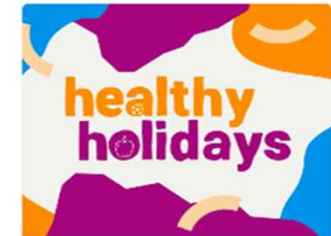
Healthy Holidays Food and activity clubs for children during the school holidays.