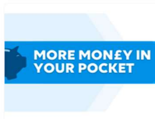
More Money in Your Pocket Help with the cost of living.